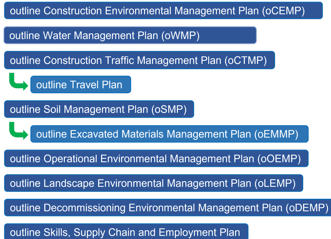
Figure 1-1 Environmental Management Plans Hierarchy

1.1.11. The following additional environmental management plans are secured by this oCEMP and will be prepared as part of the CEMP (s) prior to construction of the Proposed Development: